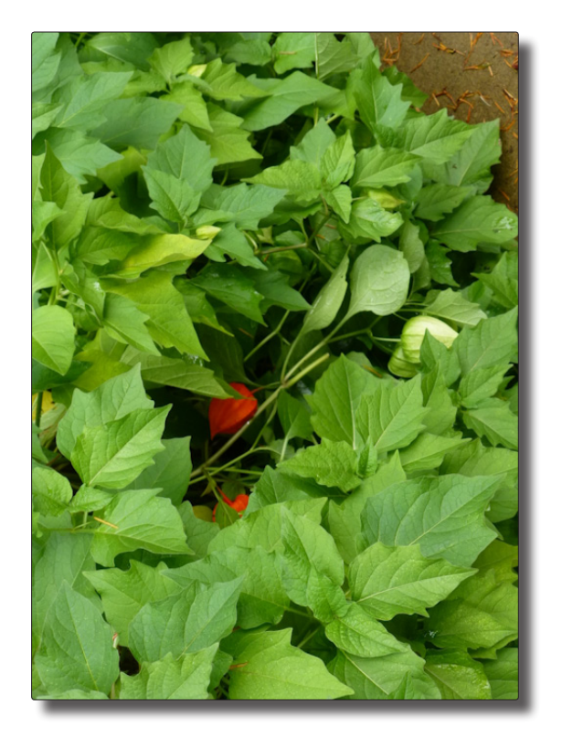
2014 Winter Retreat Images by Betty Vail